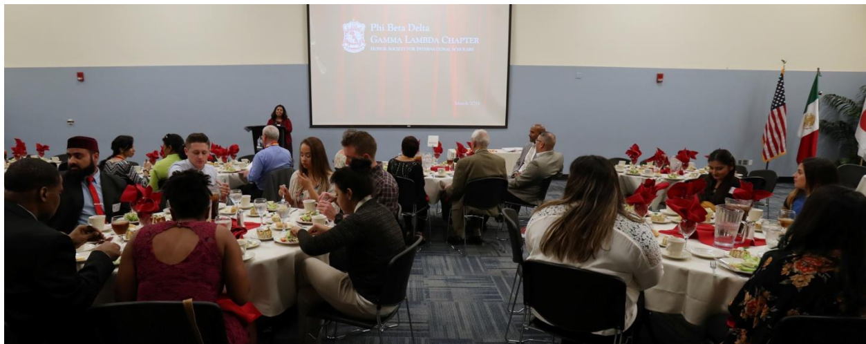
Gamma Lambda attendees of the March 2017 Winter Banquet