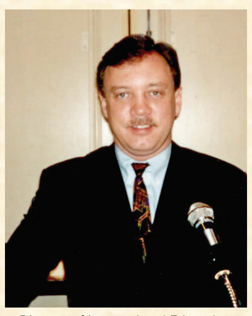
Director of International Education, California State University, Long Beach