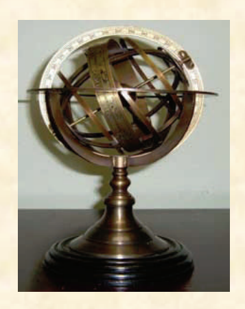
Domestic Student Award for International Achievement