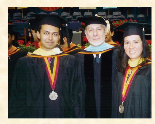
Graduates wearing medallion at their graduation ceremony.