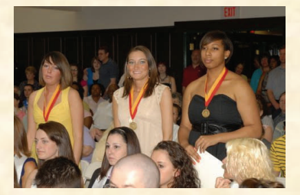
Delta Sigma Chapter—2007 Mt. Ida College

Epsilon Tau Chapter, CIMBA, a consortium of universities based in the towns of Asolo and Padorno del Grappa, Italy.