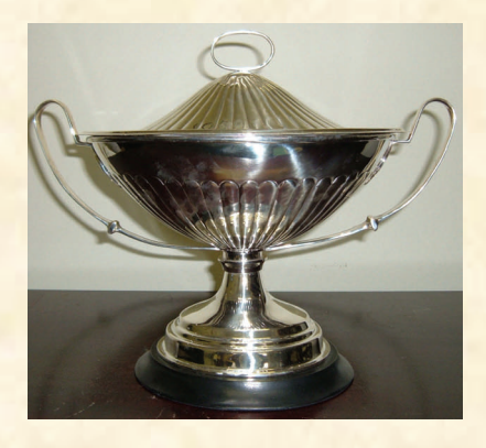
Yvonne Captain Faculty Award for Outstanding Contributions to International Education