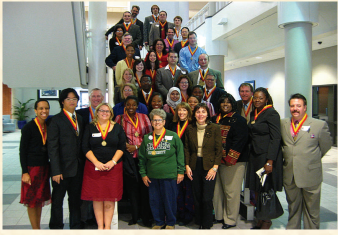
Beta Lambda Chapter—2007 University of New Orleans