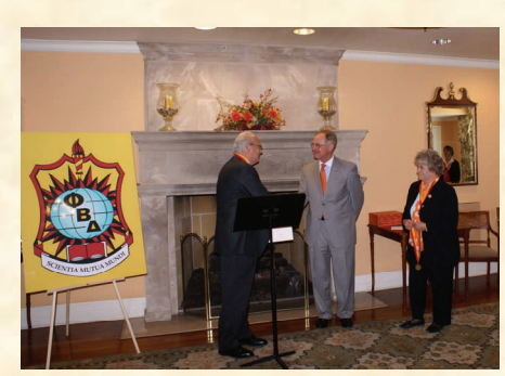
Epsilon Upsilon Chapter-2009