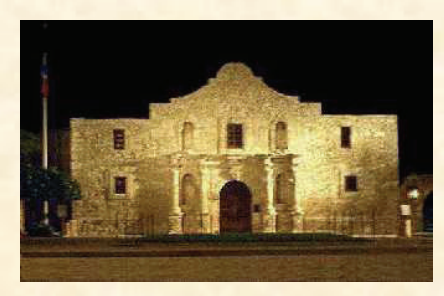
The Alamo, Symbol of the San Antonio Conferences, 1995 and 2007