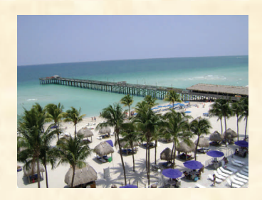
View from North Miami Beach, at Sunny Isles, 2009