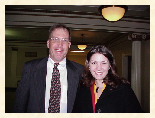
Proud father and his American daughter who has returned from study abroad.