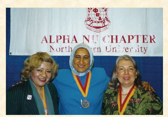
Women at reception for recently inducted students.