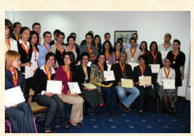
Epsilon Alpha Chapter—2009 American University of Bulgaria