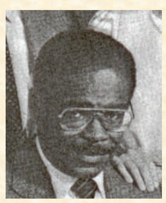
Dean, College of Humanities California State University, Long Beach