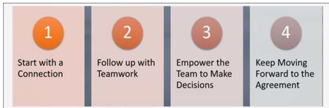
Figure 5. The Agile Process to Develop an International Exchange and Dual Degree Program

In our paper, we identified the agile process, showing its value and practices in business and higher education today and introduced an example of an agile process for developing an international exchange and dual degree program. It can be a simple 4-step agile process as shown in Figure 5. Every step is agile by following the "Law of the Customer," "the Law of the Small Team," and "the Law of the Network."